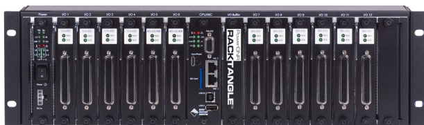
UEIPAC 1200R RACKtangle 12 Slot Programmable Automation Controller